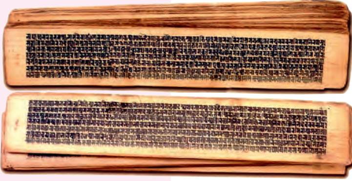
Rgveda (padapāṭha) manuscript in Devanagari, early 19th century