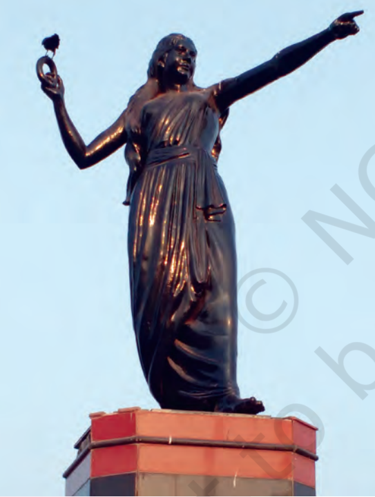
Kannagi from the Tamil Epic Silappathikaram

The Rāmāyaṇa is considered as the foremost literature in classical Sanskrit and its author Vālmīki is known as the 'Ādikavi'. The Rāmāyaṇa is a saga of life of Lord Rama which is composed in 24000 verses. The epic is the source of inspiration for many poets in ancient, medieval and even the modern times. The Mahābhārata is written by Vedavyāsa who enriched our literature with significant literary and shastric treatises like the Purāṇas and Brahmasūtras , and perhaps the first to write Vedas . The Mahābhārata consists of one lakh verses which are supposed to be the largest work of literature in any time and in any language. Indian tradition treasures a legend saying that any knowledge related to humankind has a place in the Mahābhārata . The world famous Bhagavad-Gīta , consisting of 700 verses forms a part of the Mahābhārata in the 6th Parva (chapter) out of its 18 parvas . Bhagavad-Gīta is a complete philosophical doctrine which answers our personal emotional dilemmas. It shows threefold paths to seeking and attainment of salvation ( mokṣa ) which are the paths of Karma , Jñāna and Bhakti .