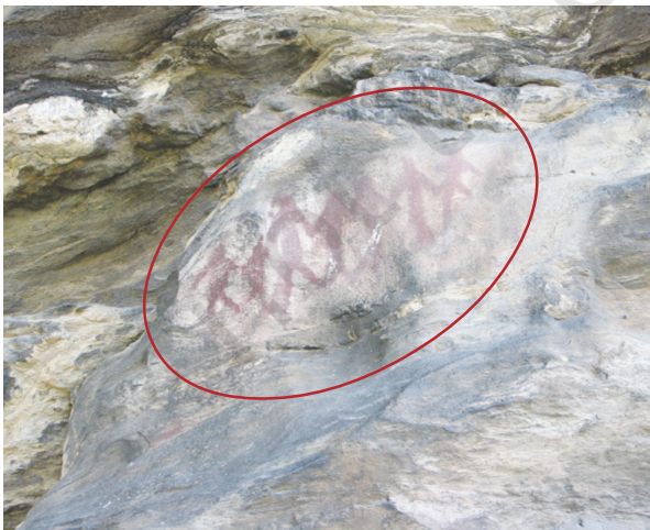
Hand-linked dancing figures, Lakhudiyar, Uttarakhand

Remnants of rock paintings have been found on the walls of the caves situated in several districts of Madhya Pradesh, Uttar Pradesh, Andhra Pradesh, Karnataka and Bihar. Some paintings have been reported from the Kumaon hills in Uttarakhand also. The rock shelters on banks of the River Suyal at Lakhudiyar, about twenty kilometres on the Almora–Barechina road, bear these prehistoric paintings. Lakhudiyar literally means one lakh caves. The paintings here can be divided into three categories: man, animal and geometric patterns in white, black and red ochre. Humans are represented in stick-like forms. A long-snouted animal, a fox and a multiple legged lizard are the main animal motifs. Wavy lines, rectangle-filled geometric designs, and groups of dots can also be seen here. One of the interesting scenes depicted here is of hand-linked dancing human figures. There is some superimposition of paintings. The earliest are in black; over these are red ochre paintings and the last group comprises white paintings. From Kashmir two slabs with engravings have been reported. The granite rocks of Karnataka and Andhra Pradesh provided suitable canvases to the Neolithic man for his paintings. There are several such sites but more famous among them are Kupgallu, Piklihal and Tekkalkota. Three types of paintings have been reported from here—paintings in white, paintings in red ochre over a white background and paintings in red ochre. These