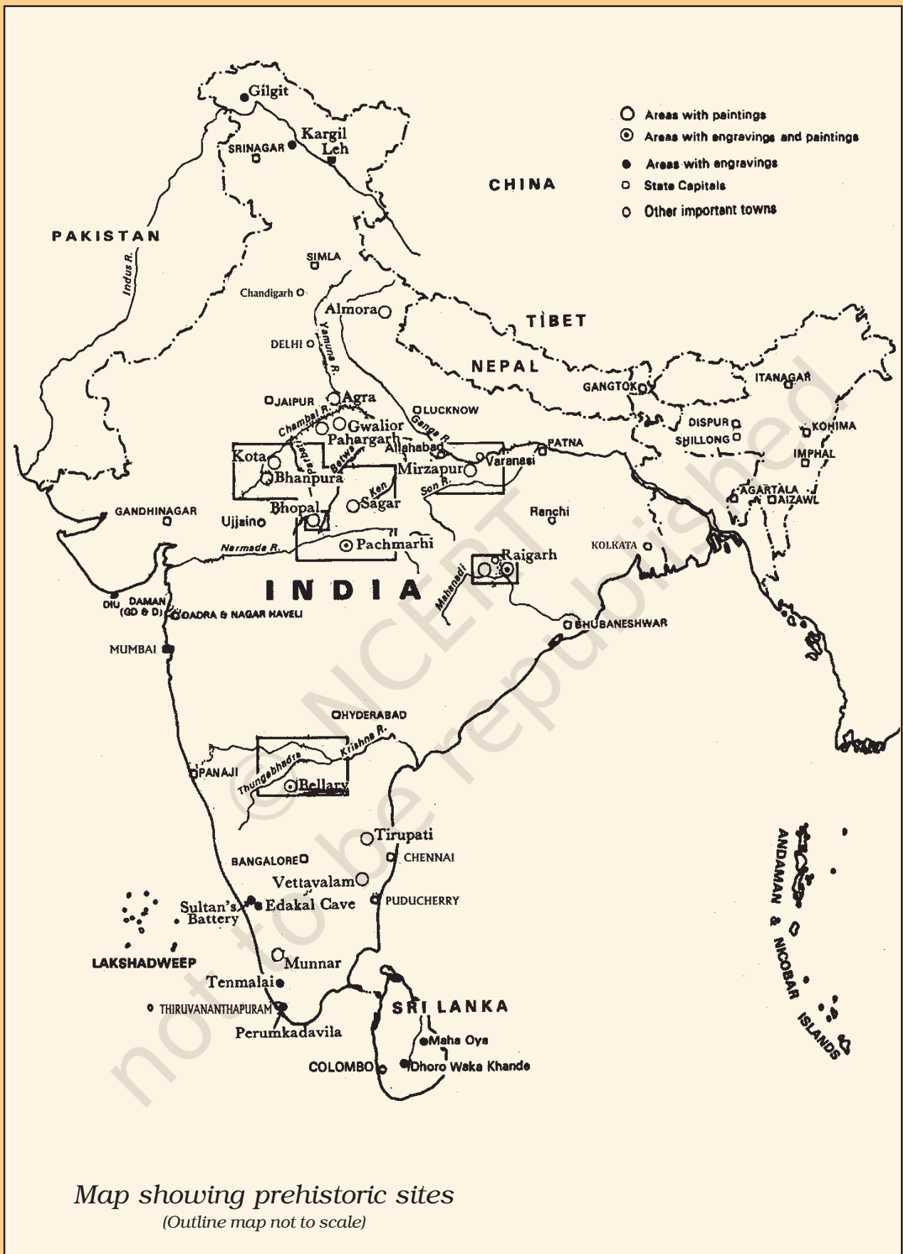
Map showing prehistoric sites (Outline map not to scale)