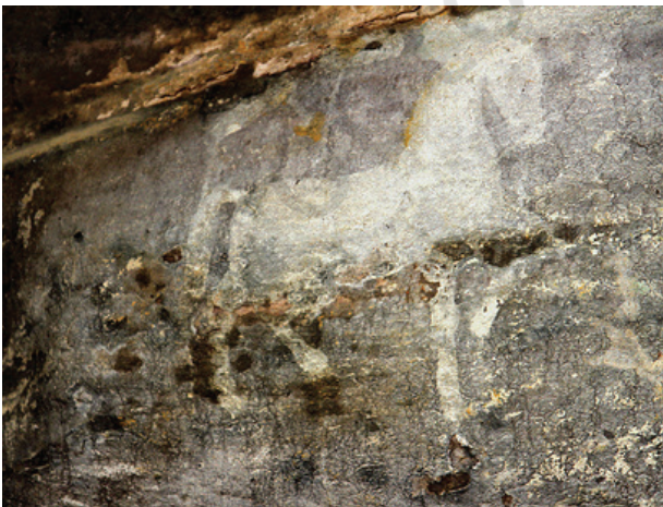
One of the few images showing only one animal, Bhimbetka

The artists of Bhimbetka used many colours, including various shades of white, yellow, orange, red ochre, purple, brown, green and black. But white and red were their favourite colours. The paints were made by grinding various rocks and minerals. They got red from haematite (known as geru in India). The green came from a green variety of a stone called chalcedony. White might have been