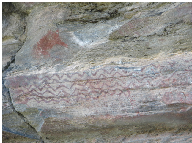
Wavy lines, Lakhudiyar, Uttarakhand