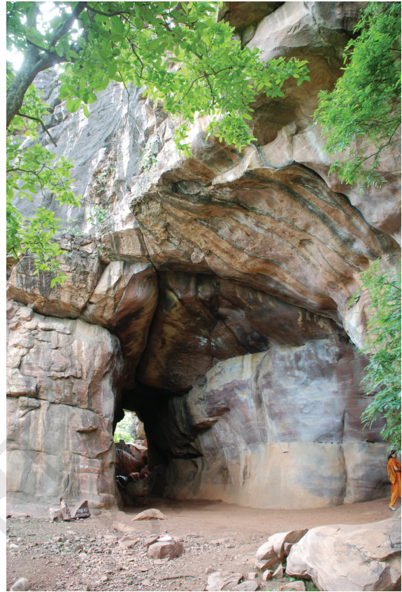
Cave entrance, Bhimbetka, Madhya Pradesh

The paintings of the Upper Palaeolithic phase are linear representations, in green and dark red, of huge animal figures, such as bisons, elephants, tigers, rhinos and boars besides stick-like human figures. A few are wash paintings but mostly they are filled with