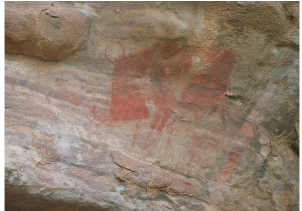
Painting showing a man being hunted by a beast, Bhimbetka

made out of limestone. The rock of mineral was first ground into a powder. This may then have been mixed with water and also with some thick or sticky substance such as animal fat or gum or resin from trees. Brushes were made of plant fibre. What is amazing is that these colours have survived thousands of years of adverse weather conditions. It is believed that the colours have remained intact because of the chemical reaction of the oxide present on the surface of the rocks.