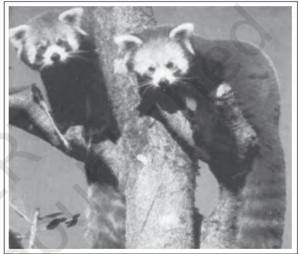
Figure 14.2 : Red Panda — an endangered species

It includes those species which are in danger of extinction. The IUCN publishes information about endangered species world-wide as the Red List of threatened species.