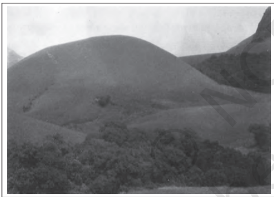
Figure 14.1 : Grasslands and sholas in Indira Gandhi National Park, Annamalai, Western Ghats — an example of ecosystem diversity

You have studied about the ecosystem in the earlier chapter. The broad differences between ecosystem types and the diversity of habitats and ecological processes occurring within each ecosystem type constitute the ecosystem diversity. The 'boundaries' of communities (associations of species) and ecosystems are not very rigidly defined. Thus, the demarcation of ecosystem boundaries is difficult and complex.