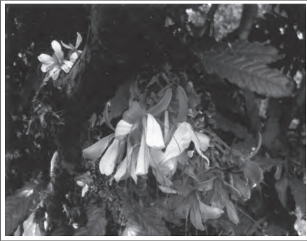
Figure 14.3 : Humboldtia decurrens Bedd — highly rare endemic tree of Southern Western Ghats (India)

There is an urgent need to educate people to adopt environment-friendly practices and reorient their activities in such a way that our development is harmonious with other life forms and is sustainable. There is an increasing consciousness of the fact that such conservation with sustainable use is possible only with the involvement and cooperation of local communities and individuals. For this, the development of institutional structures at local levels is necessary. The critical problem is not merely the conservation of species nor the habitat but the continuation of process of conservation.