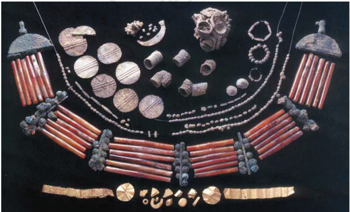
Beadwork and jewellery items

It is evident from the discovery of a large number of spindles and spindle whorls in the houses of the Indus