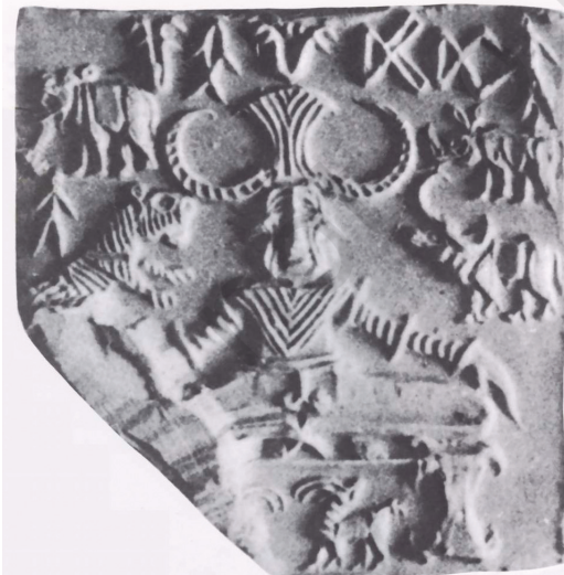
Pashupati seal/female deity

goat and also monsters. Sometimes trees or human figures were also depicted. The most remarkable seal is the one depicted with a figure in the centre and animals around. This seal is generally identified as the Pashupati Seal by some scholars whereas some identify it as the female deity. This seal depicts a human figure seated cross-legged. An elephant and a tiger are depicted to the right side of the seated figure, while on the left a rhinoceros and a buffalo are seen. In addition to these animals two antelopes are shown below the seat. Seals such as these date from between 2500 and 1900 BCE and were found in considerable numbers in sites such as the ancient city of Mohenjodaro in the Indus Valley. Figures and animals are carved in intaglio on their surfaces.