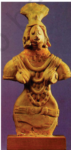
Mother goddess, terracotta

The art of bronze-casting was practised on a wide scale by the Harappans. Their bronze statues were made using the 'lost wax' technique in which the wax figures were first covered with a coating of clay and allowed to dry. Then the wax was heated and the molten wax was drained out through a tiny hole made in the clay cover. The hollow mould thus created was filled with molten metal which took the original shape of the object. Once the metal cooled, the clay cover was completely removed. In bronze we find human as well as animal figures, the best example of the former being the statue of a girl popularly titled 'Dancing Girl'. Amongst animal figures in bronze the buffalo with its uplifted head, back and sweeping horns and the goat are of artistic merit. Bronze casting was popular at all the major centres of the Indus Valley Civilisation. The copper dog and bird of Lothal and the bronze figure of a bull from Kalibangan are in no way inferior to the human figures of copper and bronze from Harappa and Mohenjodaro. Metal-casting appears to be a continuous tradition. The late Harappan and Chalcolithic sites like Daimabad in Maharashtra yielded excellent examples of metal-cast