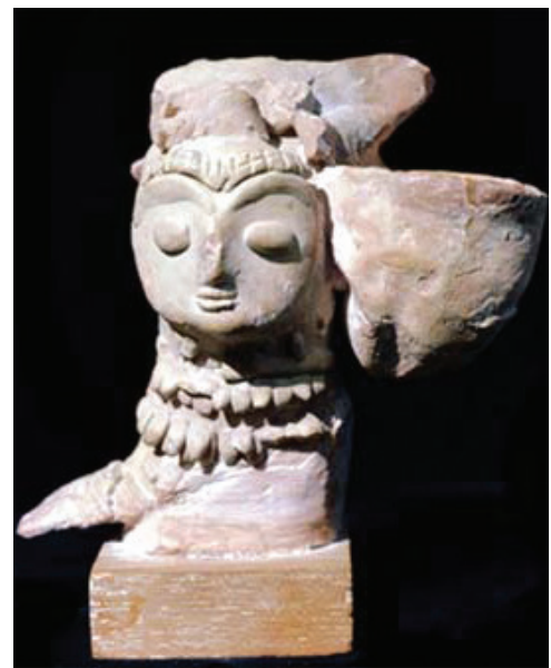
A terracotta figurine