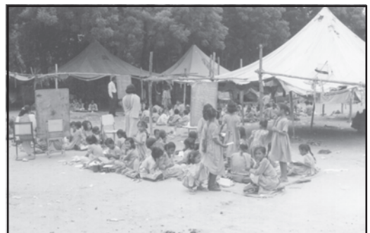
Discuss the visuals (Two types of schools)

For the sociologists who perceive society as unequally differentiated, education functions as a main