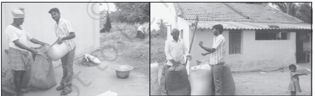
Threshing of paddy in a village