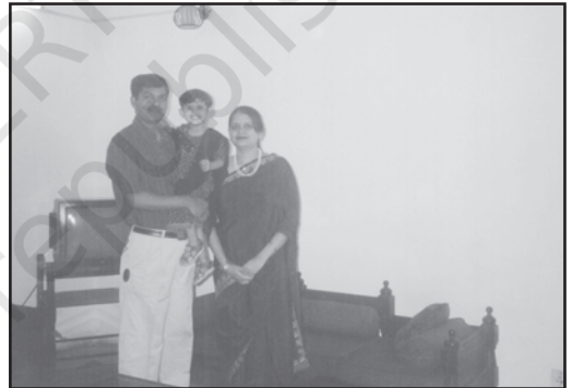
Notice how families and residences are different