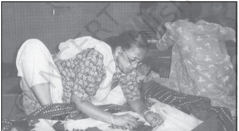
Different Types of Work

physical effort, which has as its objective the production of goods and services that cater to human needs.