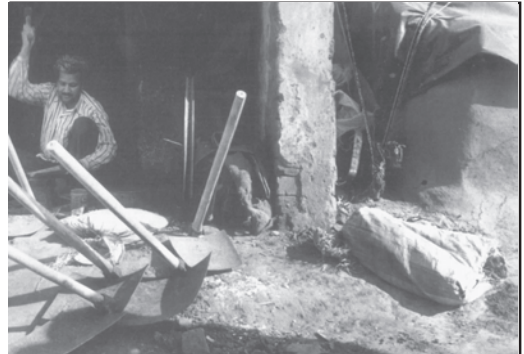
Work and Home