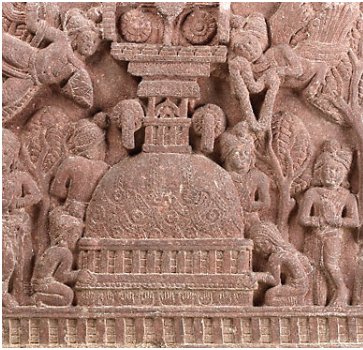
Stupa worship, Bharhut

The method of working was collective in nature and at times only a specific portion of the monument is said to have been patronised by a particular patron. Traders recorded their donation along with their place of origin.