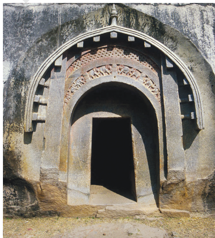
Lomus Rishi cave-entrance detail