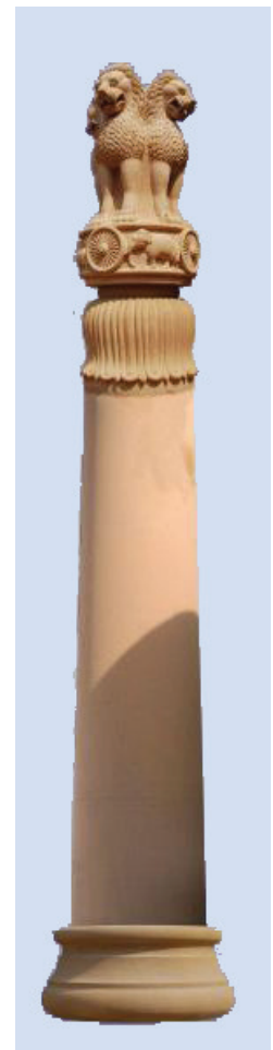
Pillar capital and abacus with stylised lotus

Construction of stupas and viharas as part of monastic establishments became part of the Buddhist tradition. However, in this period, apart from stupas and viharas , stone pillars, rock-cut caves and monumental figure sculptures were carved at several places. The tradition of constructing pillars is very old and it may be observed that erection of pillars was prevalent in the Achaemenian empire as well. But the Mauryan pillars are different from the Achaemenian pillars. The Mauryan pillars are rock-cut pillars thus displaying the carver's skills, whereas the Achaemenian pillars are constructed in pieces by a mason. Stone pillars were erected by Ashoka, which have been found in the north Indian part of the Mauryan Empire with inscriptions engraved on them. The top portion of the pillar was carved with capital figures like the bull, the lion, the elephant, etc. All the capital figures are vigorous