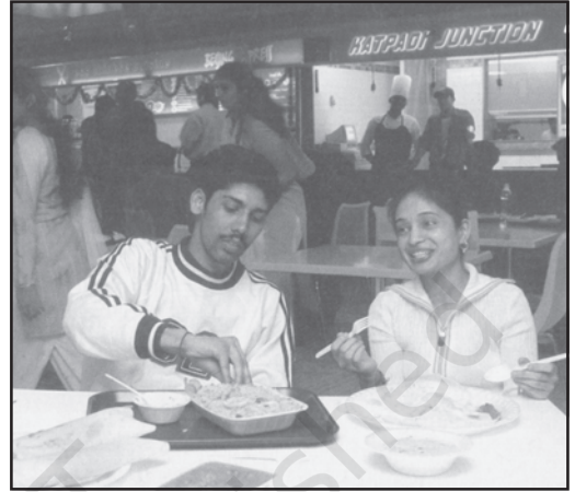
Discuss how the visual captures a way of life

habits acquired by man as a member of society" (Tylor 1871).