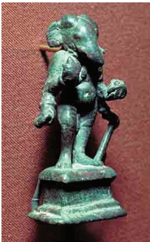
Ganesh, Kashmir, seventh century CE

Andhra Pradesh in the third century CE and at the same time there is a significant change in the draping style of the monk's robe. Buddha's right hand in abhaya mudra is free so that the drapery clings to the right side of the body contour. The result is a continuous flowing line on this side of the figure. At the level of the ankles of the Buddha figure the drapery makes a conspicuous curvilinear turn, as it is held by the left hand.