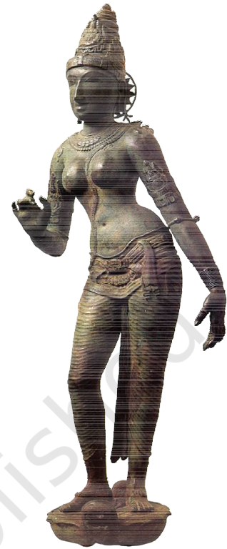
Devi, Chola bronze, Tamil Nadu

Vakataka bronze images of the Buddha from Phopnar, Maharashtra, are contemporary with the Gupta period bronzes. They show the influence of the Amaravati style of