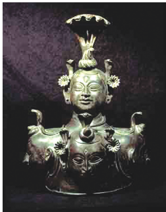
Bronze sculpture, Himachal Pradesh

A noteworthy development is the growth of different types of iconography of Vishnu images. Four-headed Vishnu, also known as Chaturanana or Vaikuntha Vishnu , was worshipped in these regions. While the central face represents Vasudeva,