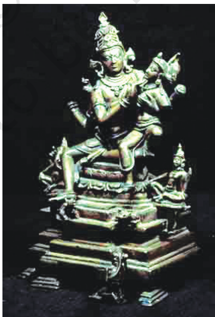
Shiva Family, tenth century CE, Bihar

Many standing Buddha images with right hand in abhaya mudra were cast in North India, particularly Uttar Pradesh and Bihar, during the Gupta and Post-Gupta periods, i.e., between the fifth, sixth and seventh centuries. The sanghati or the monk's robe is wrapped to cover the shoulders which turns over the right arm, while the other