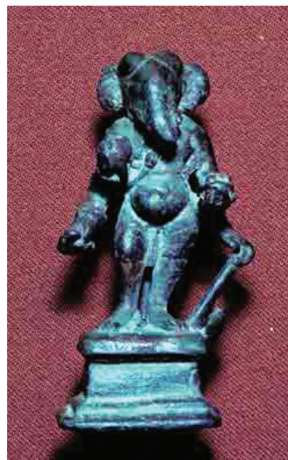
Ganesh, seventh century CE, Kashmir