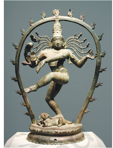
Nataraja, Chola period, twelfth century CE

The bronze casting technique and making of bronze images of traditional icons reached a high stage of development in South India during the medieval period. Although bronze images were modelled and cast during the Pallava Period in the eighth and ninth centuries, some of the most beautiful and exquisite statues were produced during the Chola Period in Tamil Nadu from the tenth to the twelfth century. The technique and art of fashioning bronze images is still skillfully practised in South India, particularly in Kumbakonam. The distinguished patron