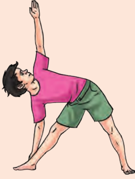
Standing Posture: Trikoṇāsana