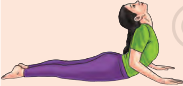
Prone Posture: Bhujāṅgāsana