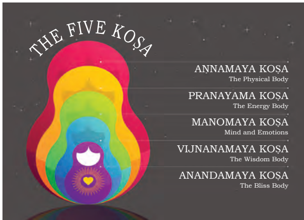
Depicting a gross body of human being showing layers of existence.