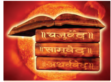
Script from Vedas

In the pre-classical era, Yoga was an incoherent mixture of various ideas and techniques that often contradicted each other. The classical period is defined by Maharshi Patanjali's yoga sutras , the first systematic presentation of Yoga. After Patanjali, many sages and Yoga masters contributed greatly for the preservation and development of the field through their well-documented practices and literature. The period between 500 B.C.–A.D. 800 is considered as the Classical period, which is also considered