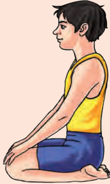
Sitting Posture: Vajrāsana