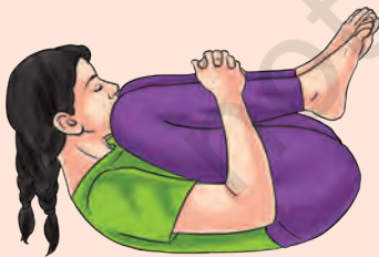
Supine Posture: Pawanamuktāsana