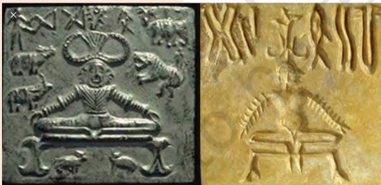
Carving on Stones of Yoga Mudrā During Indus Valley Civilisation

The history of Yoga can be traced back to pre-vedic period. The study of the history of Indus Valley Civilisation reveals that the practices of Yoga was one of the significant features during that period. Yoga is being widely considered as an ‘immortal cultural outcome’ of Indus Sarasvati Valley Civilisation—dating back to 2700 B.C., it has proved itself catering to both material and spiritual upliftment of humanity. The stones seals excavated from the sites of the Indus Valley Civilisation depicting figures in yogic postures indicated that Yoga was being practised even during 3000 B.C. The idol of Pashupati in yogic postures is one of such specimens.